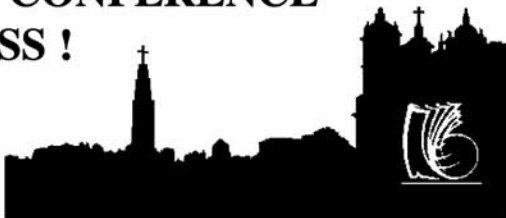
The preparations for the next UITIC Conference that will take place in Porto (Portugal) on 17-20 October 1996 continue to make progress. The general title could be "What will footwear be in the year 2000?"

Similarly, the Executive Committee is studying grouping together the speeches