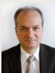
Mr Yves Morin, President of UITIC

During the 18th Congress UITIC in Guangzhou (China) in 2013, I recalled that the footwear industry had a "promising future", which was notably confirmed by world production in 2014 exceeded 24 billion pairs of shoes, an increase of 8%. Our 19th Congress will be an opportunity to present actionable insights that help define the contours of the "Future Footwear Factory" to accompany this growth.