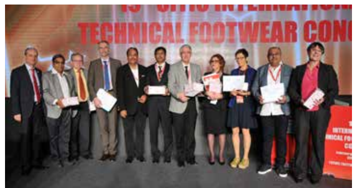
Speakers and Chairpeople of the fourth session