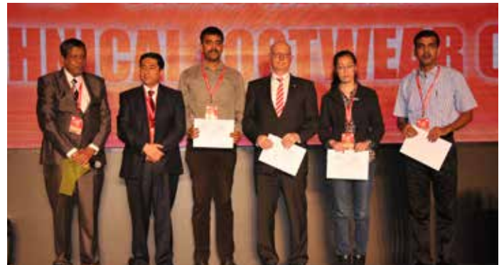
Speakers and Chairpeople of the second session