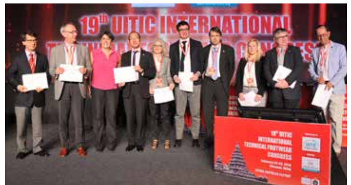
Speakers and Chairpeople of the third session